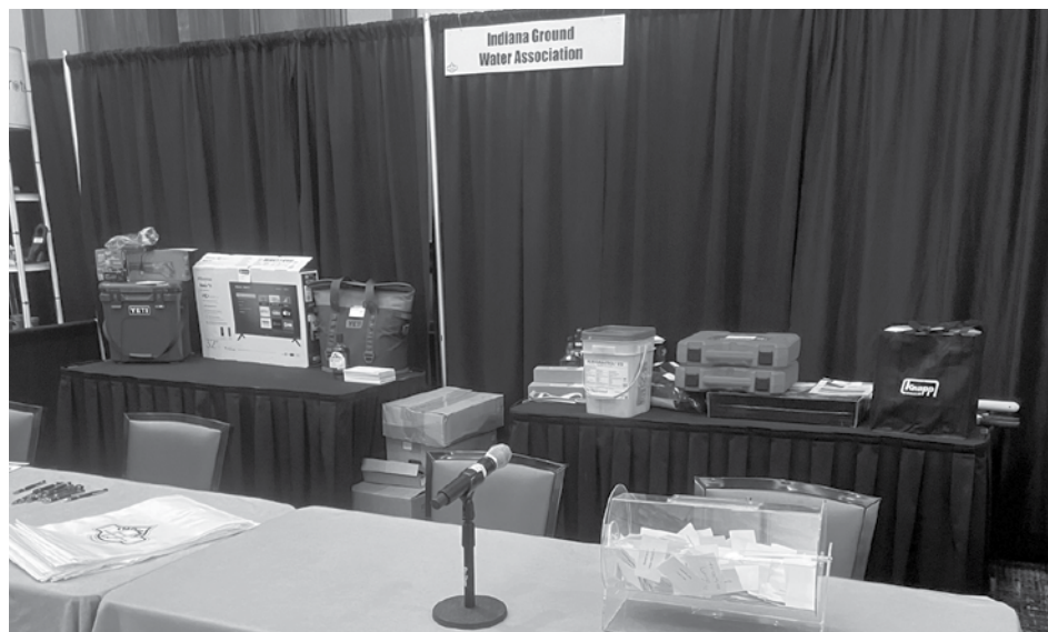
(Right) IGWA Live Auction items displayed at the Trade Show.

American Granby Amtrol Baker Manufacturing Drainage Solutions Franklin Electric GEFCO Griffin Contract Dewatering Indiana Ground Water Association Johnson Screens Kuriyama of America Mobile Drill Preferred Pump The Knapp Supply Company since 1874