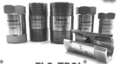
FLO-TROL® FLOW CONTROL VALVES