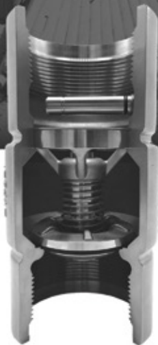
FLOMATIC® SUBMERSIBLE VFD CHECK VALVES