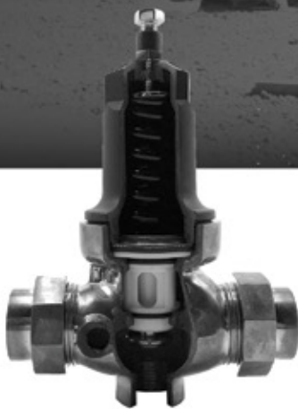
CYCLE GARD® CONSTANT PRESSURE PUMP CONTROL