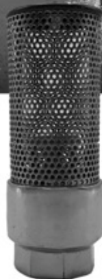
FLOMATIC® ENVIRO CHECK FOOT VALVES