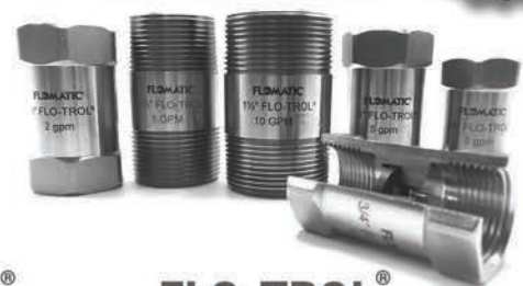
FLO-TROL® FLOW CONTROL VALVES