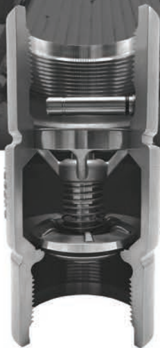
FLOMATIC® SUBMERSIBLE VFD CHECK VALVES