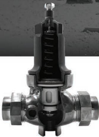
CYCLE GARD® CONSTANT PRESSURE PUMP CONTROL