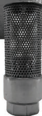
FLOMATIC® ENVIRO CHECK FOOT VALVES