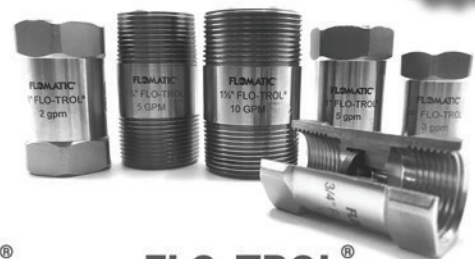
FLO-TROL® FLOW CONTROL VALVES