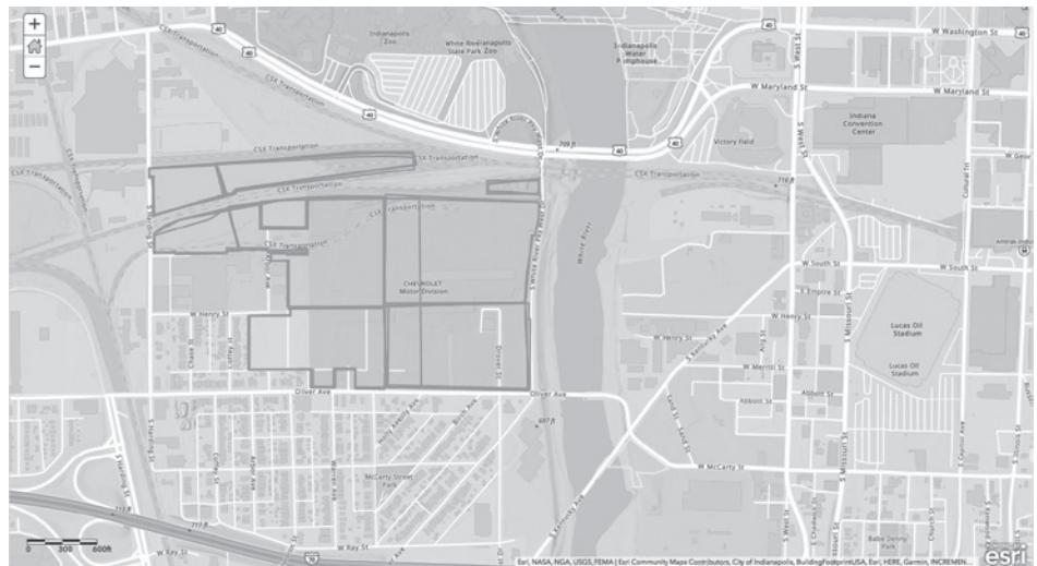
Figure 1: Interactive GIS map that list sites with institutional controls by county