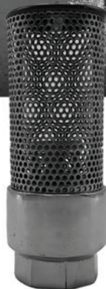
FLOMATIC® ENVIRO CHECK FOOT VALVES