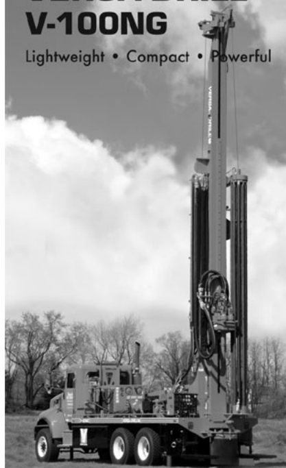
Rig shown with all options