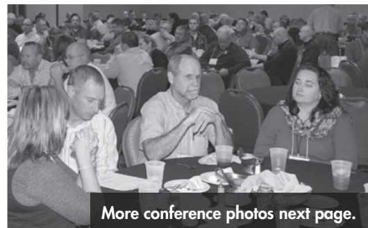
More conference photos next page.

The Scholarship Committee raised $1,802 with the Silent Auction. To access an application, go to www.indianagroundwater.org and click on "Scholarship."