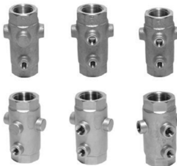
VFD Tapped Valves

Patented submersible pump check valve for use on variable flow demand (VFD) systems and applications. Standard check valves will "chatter" and be noisy when the system goes to low flow, eventually causing failure. These unique valves are designed to minimize flow losses