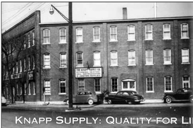
KNAPP SUPPLY: QUALITY FOR LIFE SINCE 1874